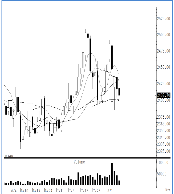
GOU24 (Close 2,407.70 Chg -22.0)

ราคาทองคำโลกผันผวนต่อเนื่อง เราแนะนำยกการ์ดสูงหรือตั้ง stop ไว้ จาก ความผันผวนของราคาที่เราคาดว่าจะแกว่งแรง แนะนำ trading ในกรอบ 2,430-2,380 ดอลลาร์ รับรู้กำไร ในกรณีที่ปิดต่ำกว่าระดับ 2,380 ดอลลาร์ แนะนำ ถือ short หวังผลปรับตัวลงไปแถว ๆ 2,340 ดอลลาร์ รับรู้กำไร